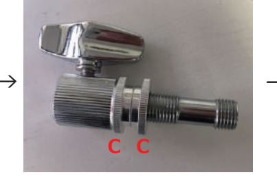
③ Attach the remaining screw "C" and turn it until it is tightly positioned against the other screw on the threaded shaft (as shown).