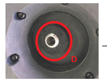
⑥ Insert the second felt "D" onto the shaft as shown.