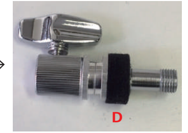
(4) Insert felt "D" (one of two) onto the main shaft.