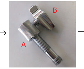
① Screw wingnut "B" into the main shaft "A".