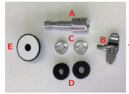
The clutch is assembled from the seven parts shown in the image.

Normally the clutch is never removed, but if this occurs, please reassemble the clutch and attach it to the top plate by following the instructions below.